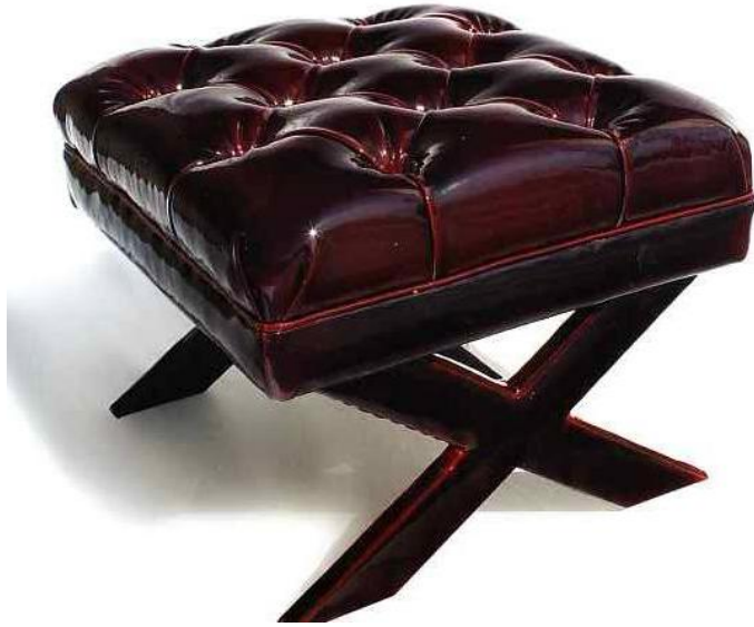
Pattern: “ Slickershock ”

Recent developments in technology have resulted in a wave of new creativity and imagination in textile design. One of the most unique and innovative textiles highlighted in this collection is pattern Slickershock ; a futuristic looking vinyl that changes color as it is stretched out for upholstery. The look is dynamite!