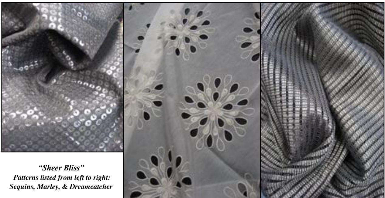
“Sheer Bliss” Patterns listed from left to right: Sequins, Marley, & Dreamcatcher

Similar to our previous sheer collections we have included basic voiles and batiste sheers, many of which pass NFPA 701, therefore making this another one stop, easy shop collection for every sheer library.