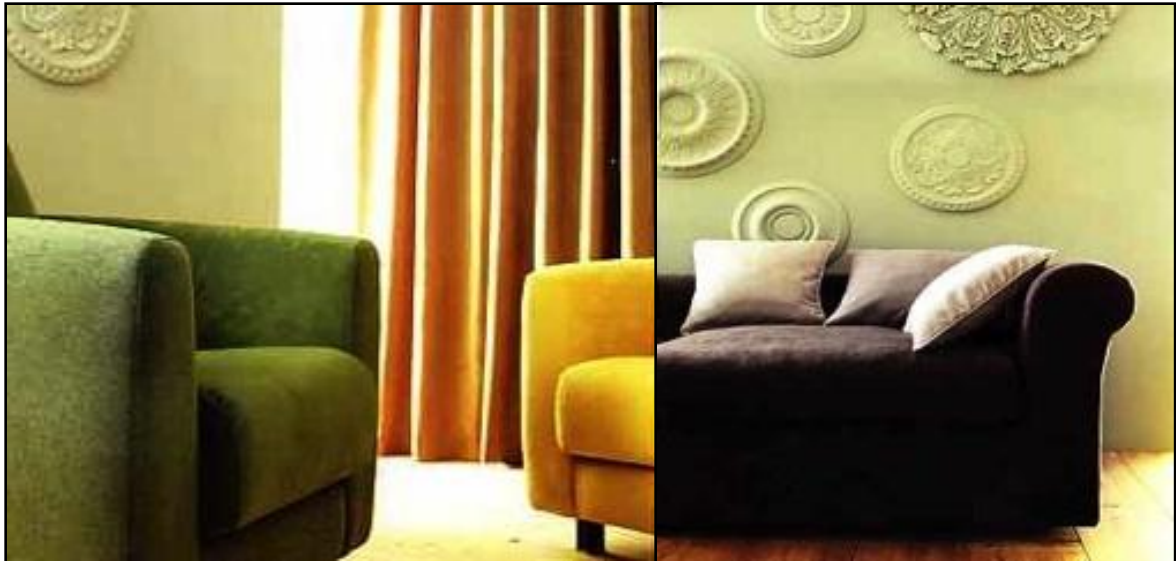
Pattern "Juneau" featured in photos