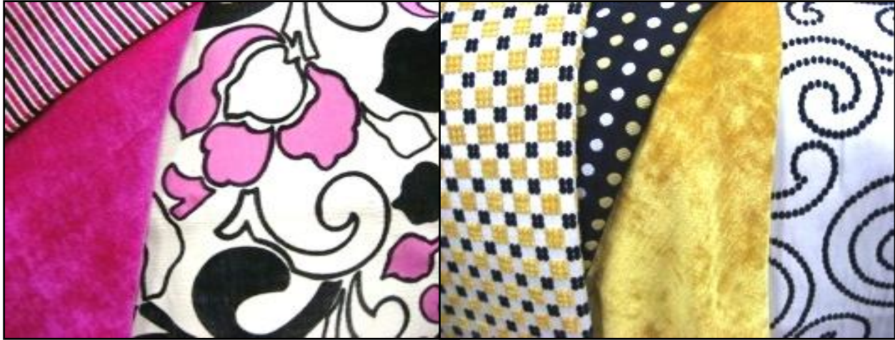
Patterns shown from V.I.P Lounge left to right: Zoom Zoom, Rory, Tickled Pink, Module, Spot Dance, Rory, Sashay

Over 90% of this collection was made exclusively by Maxwell Fabrics to pass over 30,000 double rubs and therefore the perfect resource for contract and commercial applications.