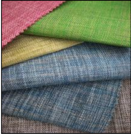
Fabric shown from "Neo" collection

NEO is the ultimate "trend" pattern of the season and exclusive to Maxwell Fabrics in North America. This linen-like texture is woven in part with shiny viscose yarns to create a metallic sheen, resulting in the perfect balance between sleek, luxurious glamour and casual elegance.