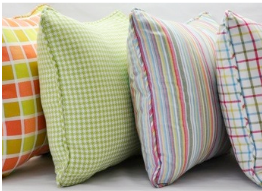
Above left to right: Bondi Beach #258 Sorbet, Salinas #208 Green Apple, Siesta Key #508 Confetti and Bazan Bay #1508 Confetti. Right image top to bottom: Siesta Key #508 Confetti, Bazan Bay #1508 Confetti, Naples #343 Lobster, Raratonga #538 Hollyhock, Tulum #888 Spring, Bondi Beach #258 Sorbet, Balos #601 Orange, Spanish Banks #70 Blossom, Salinas #208 Green Apple.