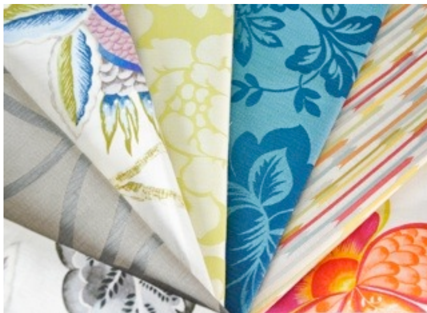
Above left to right: Adrianna #301 Geode, Capote #3 Mushroom, Adrianna #302 Tide Pool, Garden Room #22 Pear, Flourish #505 Capri, Vicus #104 Pennant, Adrianna #307 Hot House.