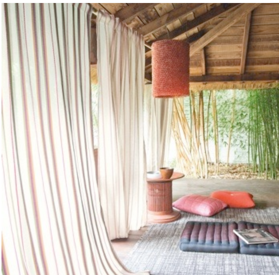
Buddha 103 River (left). Tatami #106 Giardino and Kobe #16 Sundae (above).